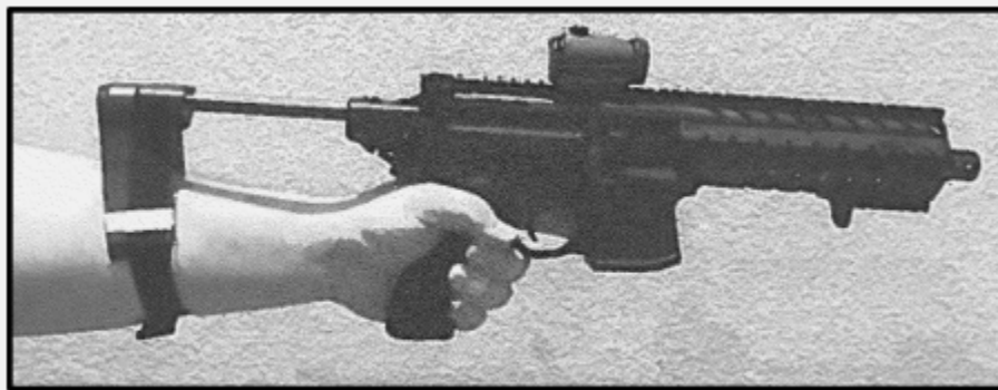
2015 submission of "adjustable stabilizing brace"

148. For example, in 2015, ATF found that attaching SB Tactical's adjustable stabilizing brace product to a pistol "would not be a 'short-barreled rifle.'" 5 Rule, 88 Fed. Reg. at 6,488; see also ATF Letter 304296 (Dec. 22, 2015), attached as Ex. N.